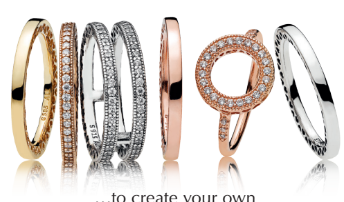
...to create your own combination of RINGS

Print out this page on A4 and place one of your rings against the circle. When the circle and the internal ring diameter match, you have found your correct ring size.