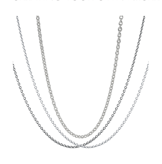
Choose your favourite CHAIN